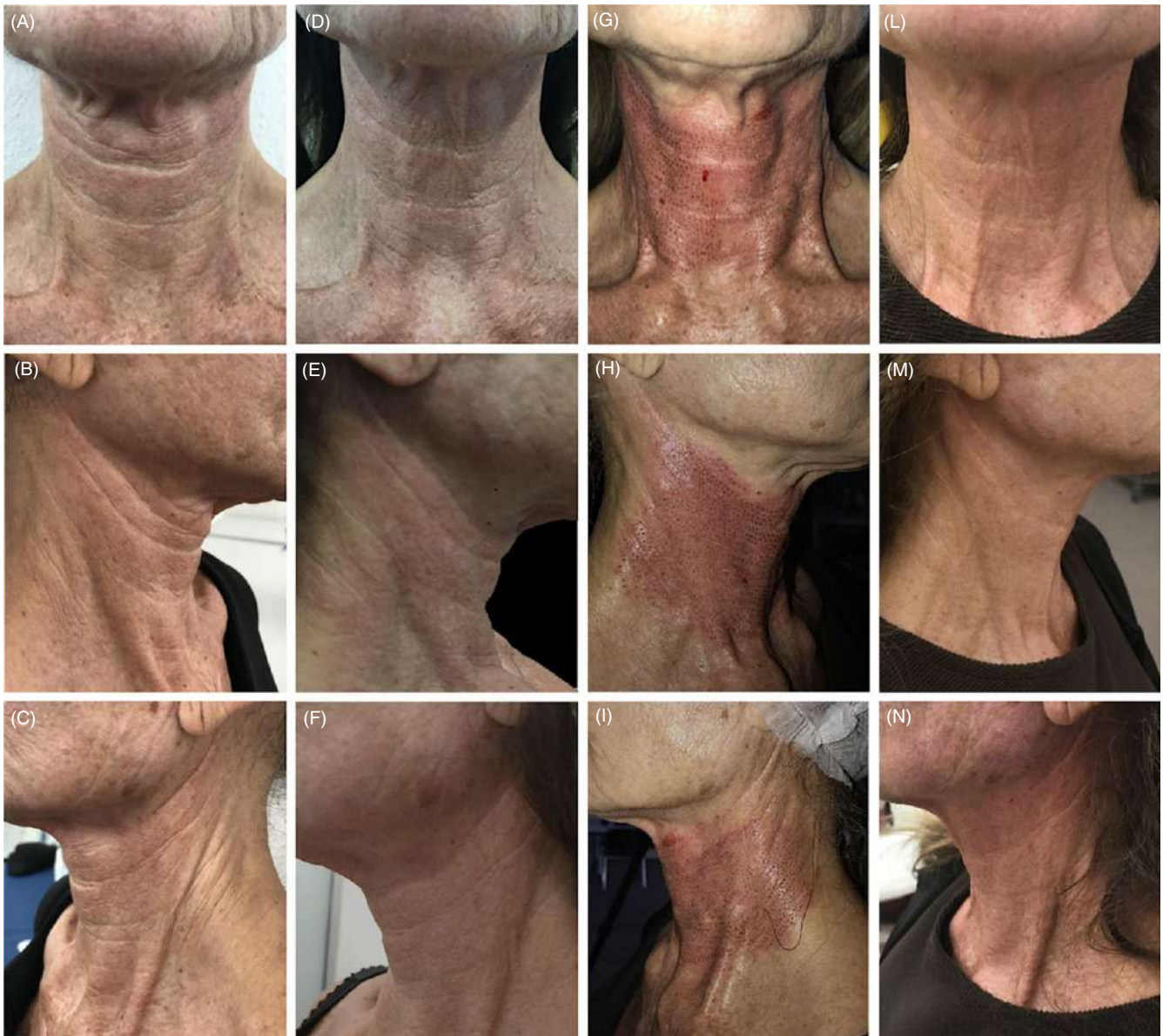
FIGURE 2 Clinical pictures of two different patients taken at t0 (panels A-C), t30 (panels D-F), after treatment (panels G-I), and t60 (panels L-N). The improvement both of cutaneous laxity and horizontal wrinkling is evident

GAIS. Photographic images were taken before the procedure, immediately after the treatment and at every subsequent visit (Figure 2). Clinical pictures were collected by using an 8-megapixel iSight camera with 1.5 \mu\text{m} pixels and an f/2.2 aperture. A 6-month follow-up visit ( \pm 2 weeks) was performed for all patients included in the study to assess the necessity of repeating the treatment.