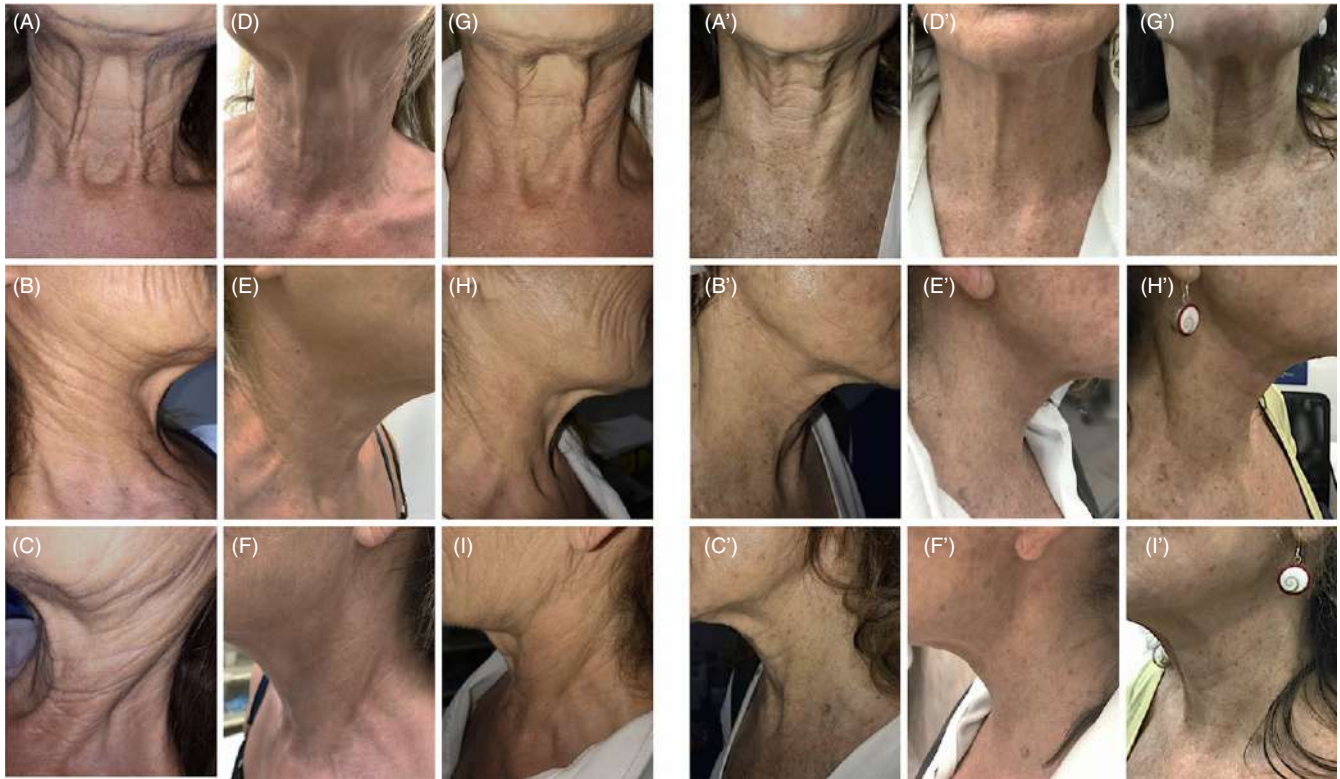
FIGURE 4 Clinical pictures of two different patients taken at t0 (panels A-C and A'-C'), t60 (D-F and D'-F'), and at 6 mo (G-I and G'-I'). The patients were still satisfied of the results achieved and did not require further treatment at 6 mo.

solution in the field of neck rejuvenation as well. Plasma exeresis is strictly operator dependent: There are no prefixed parameters and the expertise of the physician is of fundamental importance both in the choice of the spot disposition and in the timing of the spot generation. HA injection improved noticeably the results obtained with plasma exeresis. Non-cross-linked HA had the capability of flowing uniformly through entire anatomic units after injection and therefore homogeneously expanding fat compartments in challenging areas where even low viscosity fillers can produce contour irregularities.