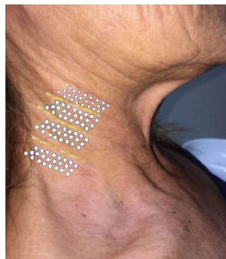
FIGURE 1 Schematic representation of the combined treatment. White dots: sites of plasma exeresis (spot technique). Yellow lines: sites of hyaluronic acid injection

Two treatment sessions were performed. During the first session (t0), after clinical evaluation, both plasma exeresis and HA injection were performed (Figure 1). At t0, patients were asked to give a score for the pain caused by the treatment according to the visual analogic scale (VAS) for pain. Patients received written indications for post-treatment care: wash the area with neutral soap, disinfect twice a day until scabs spontaneously fall off, and avoid early removal of the scabs and sun exposure for at least 1 month. The application of hypoallergenic fluid foundation was advised. Patients were re-evaluated after 30 days (t1), and HA injection was repeated. After 2 months from t0 (t2), a follow-up visit was performed to assess global efficacy of the two-step combined treatment, patient satisfaction and eventual long-term side effects. At t2, both patients and clinicians were asked to give a score for the clinical improvement according to the